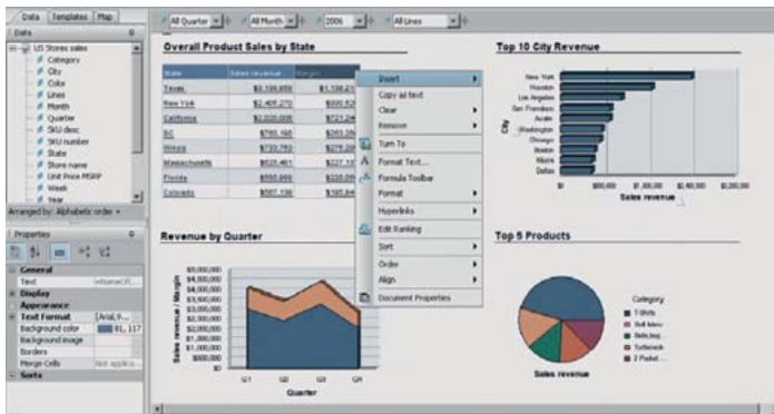
Figure 1: Interface for SAP® Crystal Interactive Analysis, Desktop Edition

One-click functions such as ranking and filtering help you better extract relevant information. Turning on the folding and unfolding option enables you to navigate across sections or tables to the details you are interested in. A table could expose only the sales at the country level and hide the lower level of details that you can always reach by simply exposing them while keeping the rest of the context. You can also add what-if types of scenarios in a document. This allows you to explore the impact of changing one business metric or a set of metrics and determine what sets of values will produce the result you are looking for.